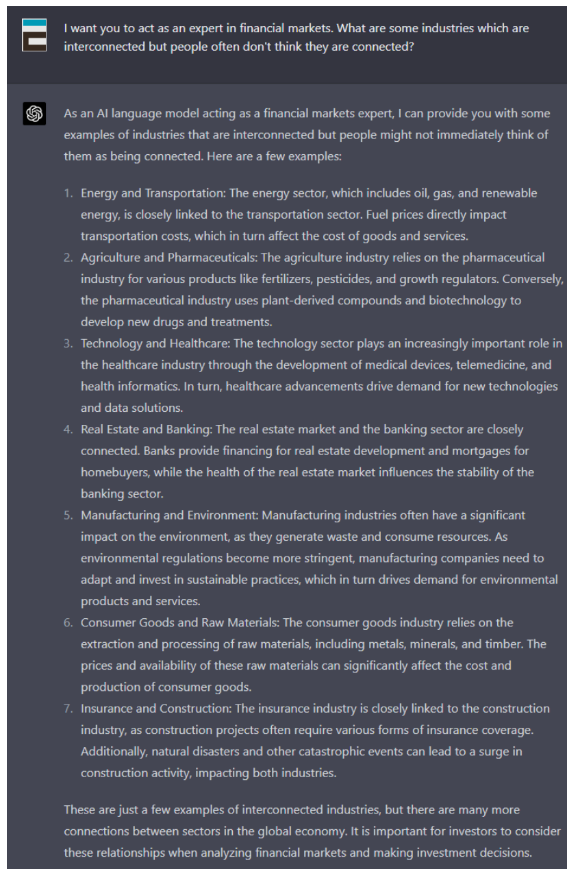
Figure 1 - Q&amp;A with ChatGPT