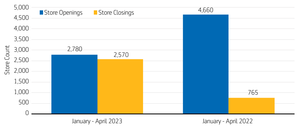
Exhibit 3: Announced store openings still exceed closings