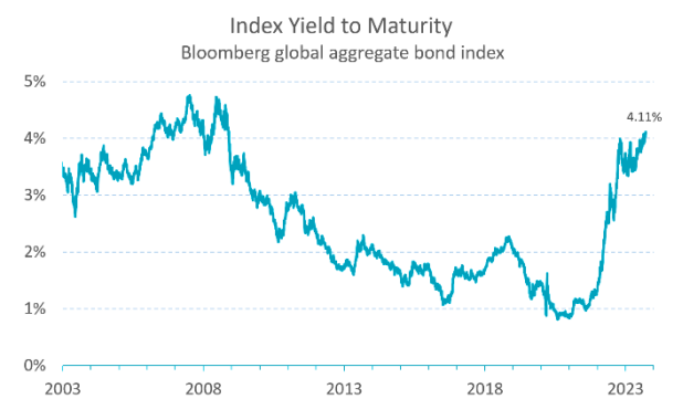
Figure 1 - Index yield has now exceeded 4%

Credit markets have continued to do well in the past few months, as spreads benefitted from the soft-landing narrative. Nonetheless, we expect the impact of policy tightening to start manifesting in the broader economy amid decelerating growth and tougher lending environments. Hence some caution is warranted. This is reflected in a somewhat conservative portfolio corporate credit beta, which is close to 1. Moving forward, we continue to believe that Euro swaps spreads and highly rated Euro SSA paper provide opportunities.